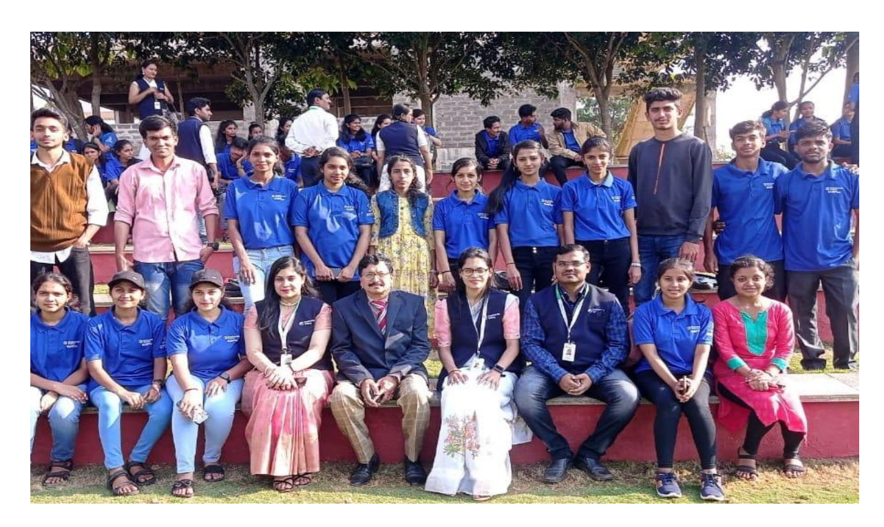
FREE TAILORING CORSE INAUGRATION