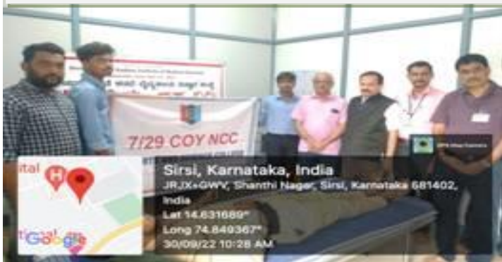
Blood donation program by N.C.C. and Red Cross Unit.