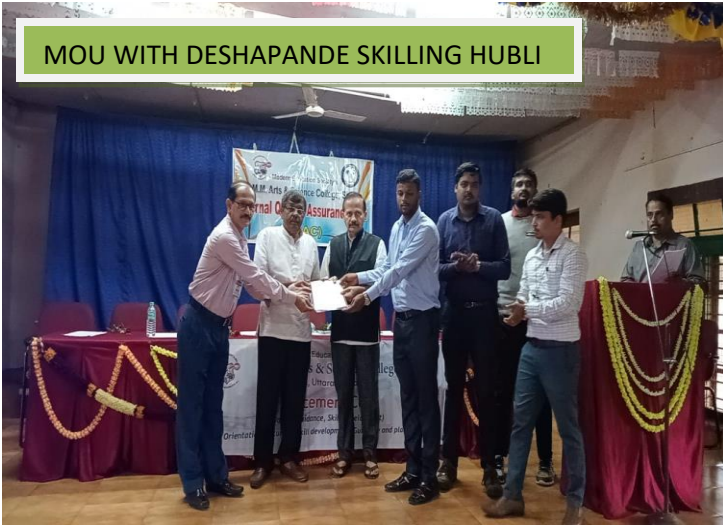
MOU WITH DESHAPANDE SKILLING HUBLI