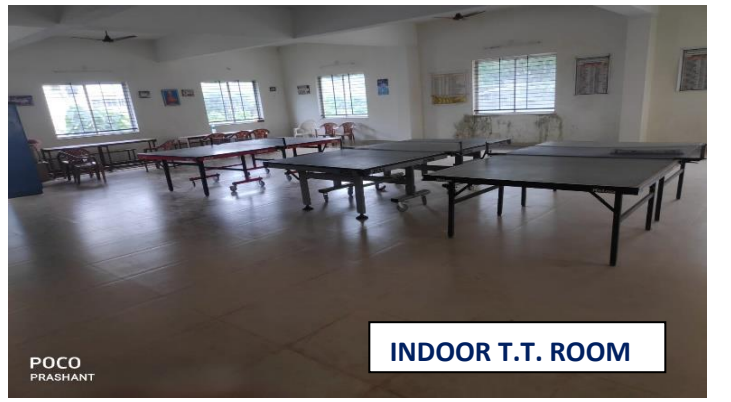
INDOOR T.T. ROOM