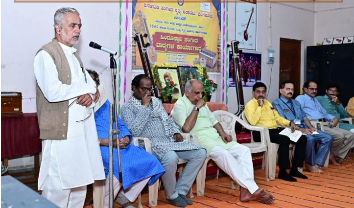
WORKSHOP ON HINDUSTANI INSTRUMENTAL MUSIC