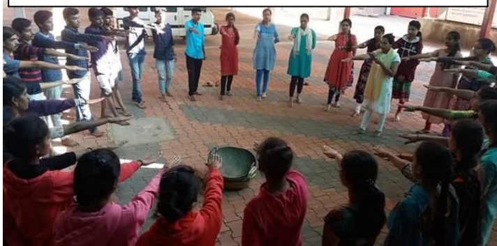
Annual special camp activities at adopted village Goli