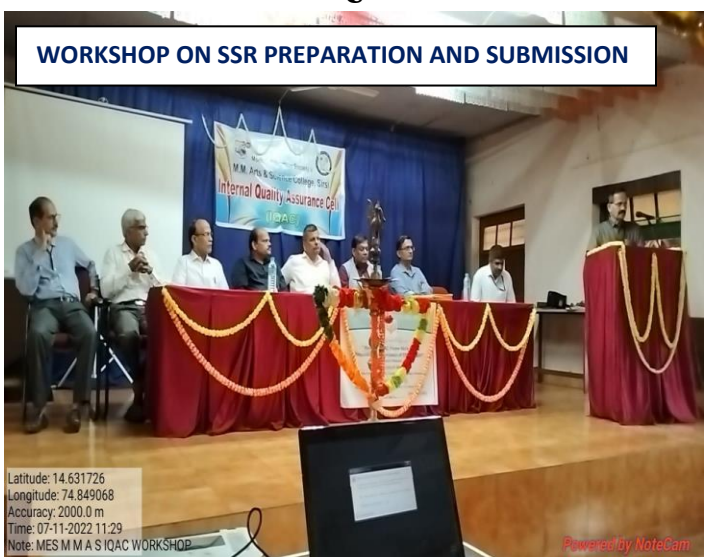
WORKSHOP ON SSR PREPARATION AND SUBMISSION

Latitude: 14.631726 Longitude: 74.849068 Accuracy: 2000.0 m Time: 07-11-2022 11:29 Note: MES M M A S IQAC WORKSHOP