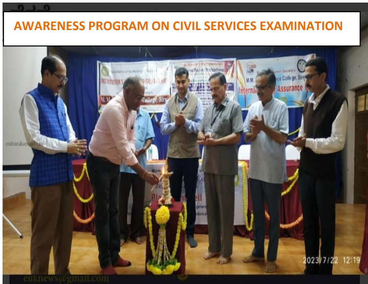
AWARENESS PROGRAM ON CIVIL SERVICES EXAMINATION