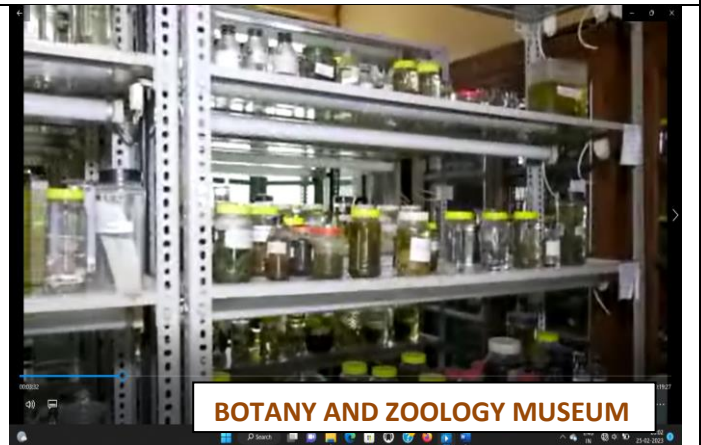
BOTANY AND ZOOLOGY MUSEUM