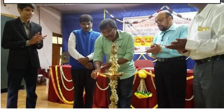
STUDENTS UNION AND GYMKHANA INAUGURAL CEREMONY