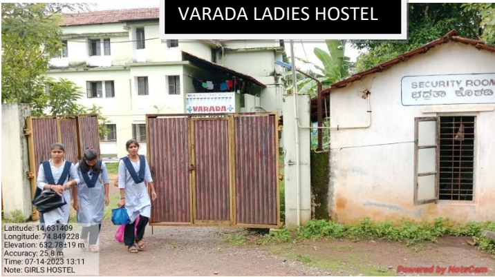
VARADA LADIES HOSTEL

Latitude: 14.631409 Longitude: 74.849228 Elevation: 632.78+19 m Accuracy: 25.8 m Time: 07-14-2023 13:11 Note: GIRLS HOSTEL